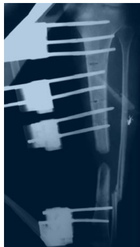
Application of the fixator with 4 clamps