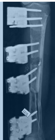
Biphocal bone transport